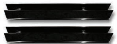
2 Strut Brackets